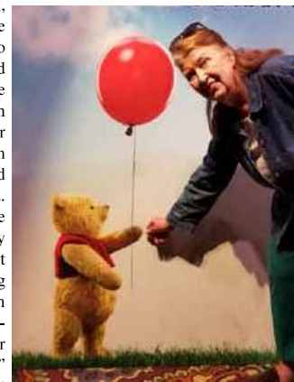
The writer at El Capitan.