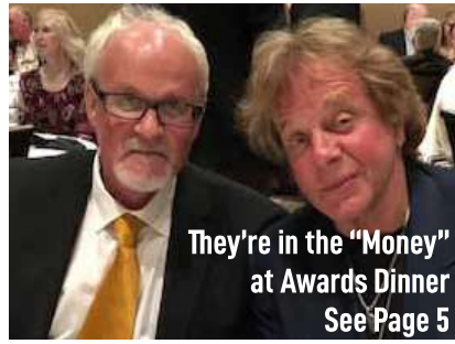
They're in the "Money" at Awards Dinner See Page 5